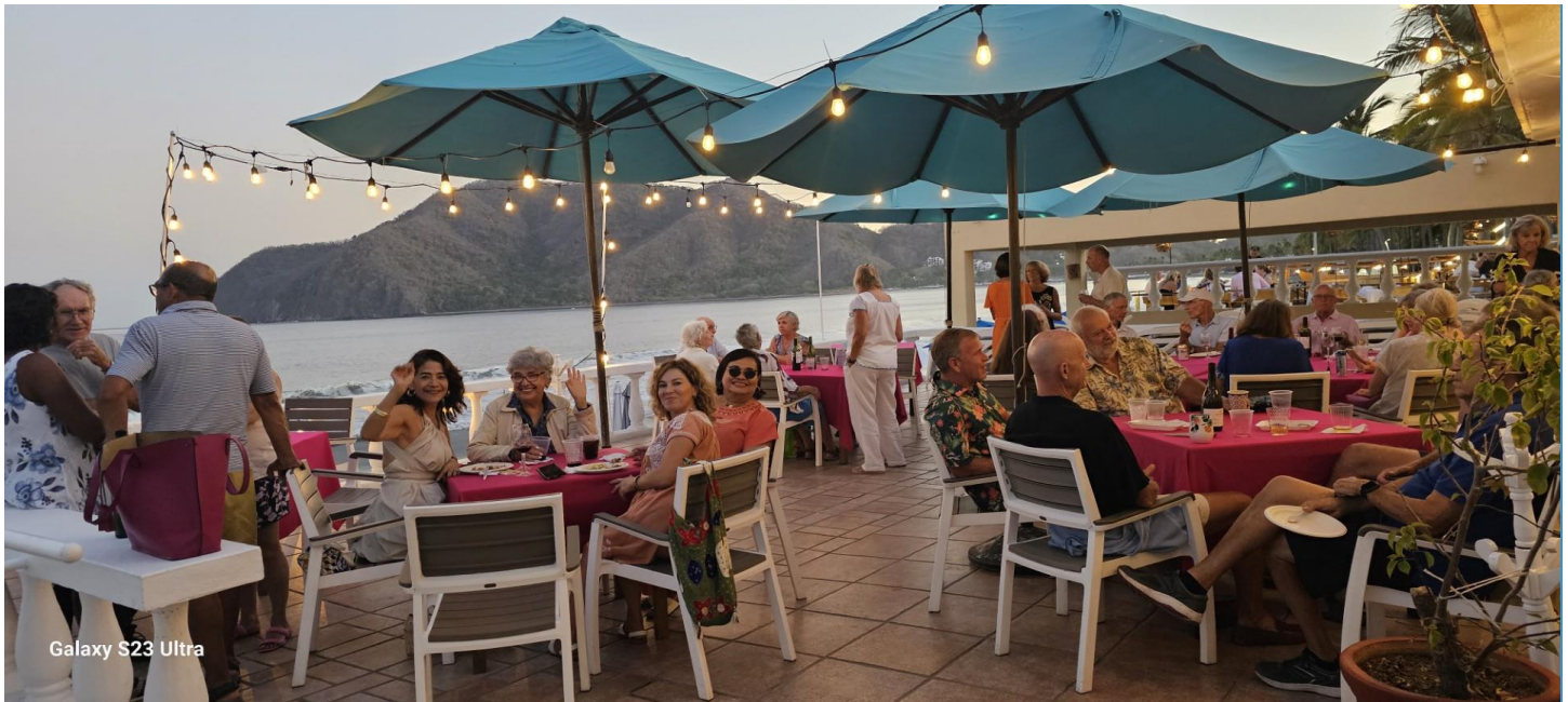
Galaxy S23 Ultra

ASOCIACIÓN DE CLUB SANTIAGO RECREATIVO AC